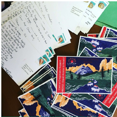
postcard campaign: equal access to roads!

Finally, we are beginning to see the ways we are called to be BOLD for the sake of liberation: our own and that of our neighborhoods and world. We play an active role in local and statewide interfaith immigrant justice groups, seeking ways to accompany our neighbors. Out of a desire to cultivate more cross-cultural friendships, a small group of Storydwellers took Spanish lessons this fall! We have been able to invest in partners we see who are doing bold work among indigenous people, immigrants and refugees, and addressing the climate crisis. Storydwelling is also excited to be a founding member of REACH, a local interfaith organization that accompanies those on Bend’s edges. Finally, we are casting visions to begin a family-run childcare cooperative. This is what we are inviting you into: be , belong and be bold alongside us.