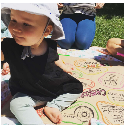
summertime Sunday mornings at Kiwanis Park

Finally, we are beginning to see the ways we are called to be BOLD for the sake of liberation: our own and that of our neighborhoods and world. We play an active role in local and statewide interfaith immigrant justice groups, seeking ways to accompany our neighbors. Out of a desire to cultivate more cross-cultural friendships, a small group of Storydwellers took Spanish lessons this fall! We have been able to invest in partners we see who are doing bold work among indigenous people, immigrants and refugees, and addressing the climate crisis. Storydwelling is also excited to be a founding member of REACH, a local interfaith organization that accompanies those on Bend’s edges. Finally, we are casting visions to begin a family-run childcare cooperative. This is what we are inviting you into: be , belong and be bold alongside us.